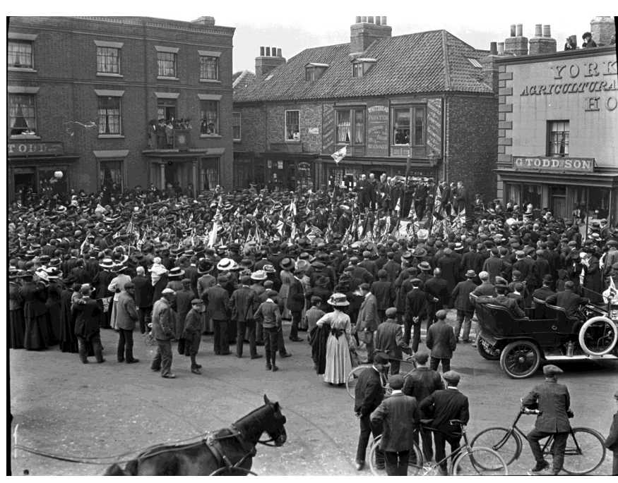
5th September 1914—Rally to raise money for the Prince of Wales Relief Fund