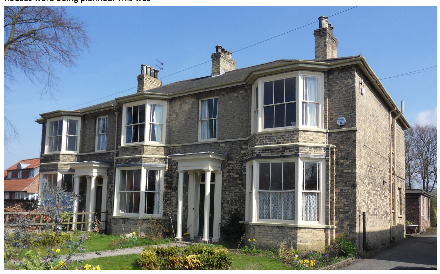
Grove House—the location of the last Urban District Council meeting in 1935

So it came as a great disappointment when the County Council proposed in 1931 that the Urban District Council should merge with the Rural District Council. In the interests of efficiency and economy, the 1929 Local Government Act required County Councils to draw up plans to reduce the number of district councils and create fewer but larger units better placed to meet the challenges of local government. Pocklington was the smallest of the East Riding's eight Urban Districts with a rateable value under £10,000. Members of the Council supported by Alfred and the other officers organised a ratepayers' protest meeting in the Victoria Hall on 28 October 1931. The strong feelings of anger prompted by the threat to remove the town's control over its own affairs were reflected in the huge attendance. A petition to the County Council highlighted the deep sense of injustice about a proposal which would strike at the town's sense of corporate identity. When the petition was put to the meeting, attended by between 500 and 600, there was only one dissenting voice.